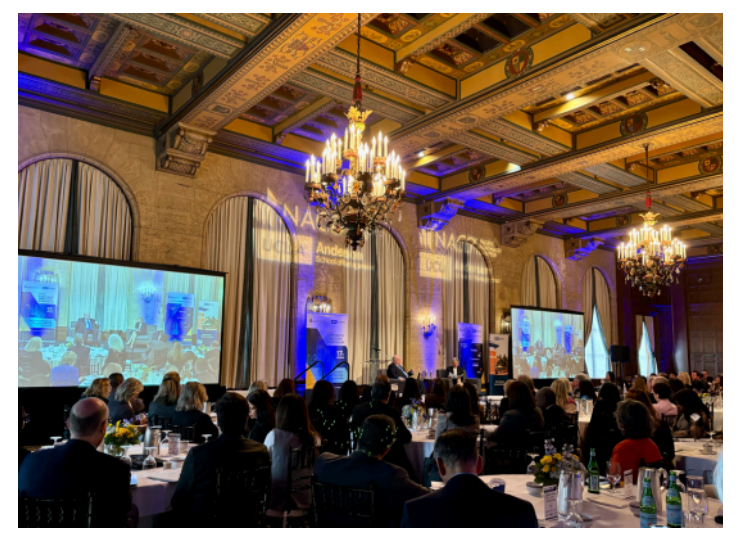
Corporate Director Symposium, Jonathan Club

The best directors are life-long learners who know what questions they should be asking in the boardroom. They enjoy expanding their networks and building new meaningful relationships. Whether hosting an event on a private yacht, or a classic cocktail hour, directors will find value in the opportunity and experience.